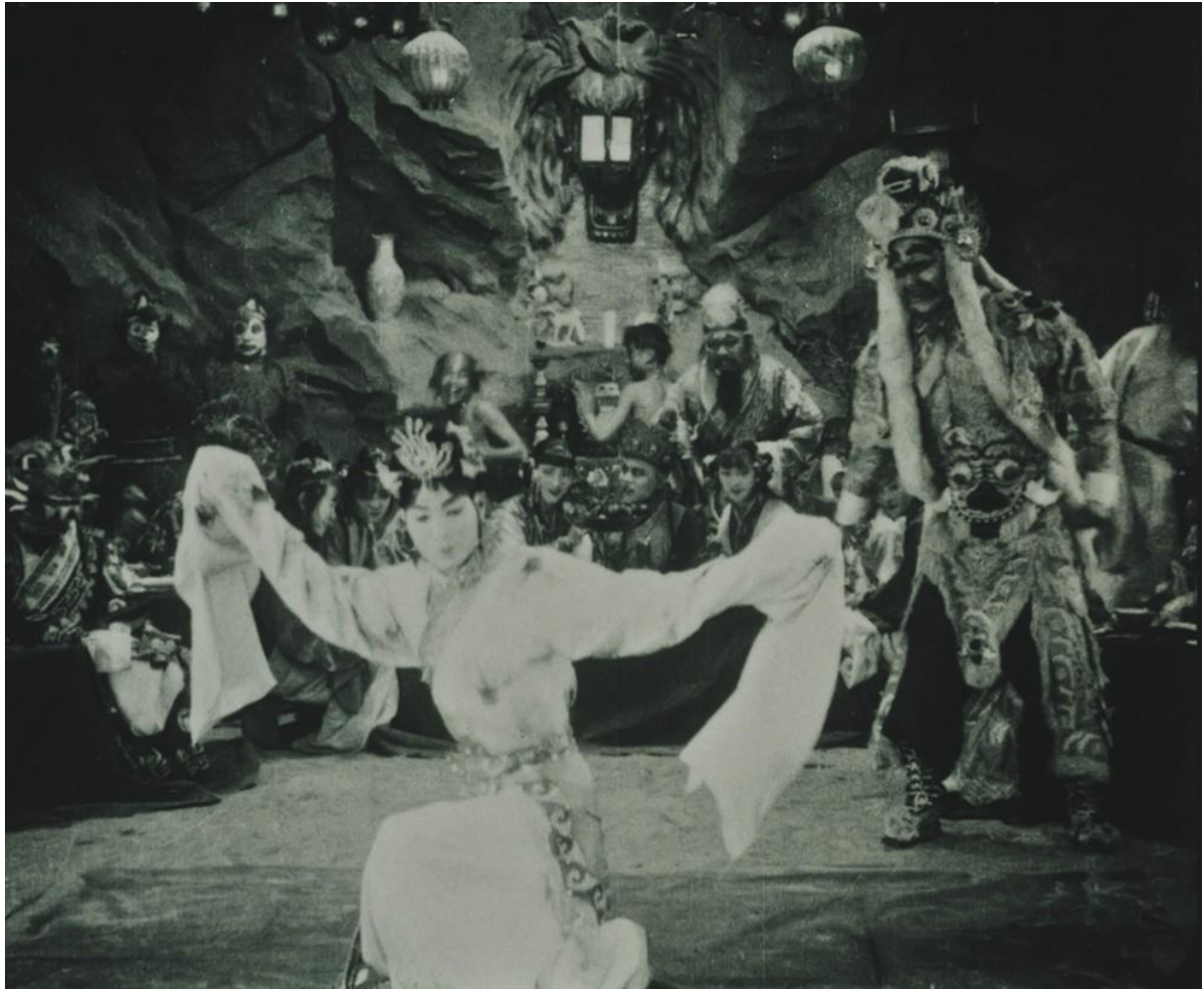
Figure 2: The lost Chinese classic The Cave of the Silken Web (1926) was accidentally found in 2013 at a provincial archive near the Arctic Circle, Mo i Rana in Norway.